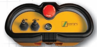
OEM version for mortar pump

The NOVA-S in combination with a Hetric's receiver assures effortless integration of the machine circuitry.