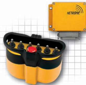
Standard Nova-S with matching receiver