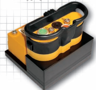
OEM version with docking station and battery charger